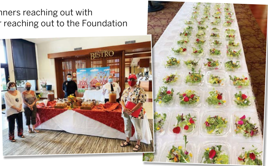
Pictured right: Residents enjoy delicious hors d'oeuvres prepared by the dining staff as part of the Circle of Friends Celebration in August.