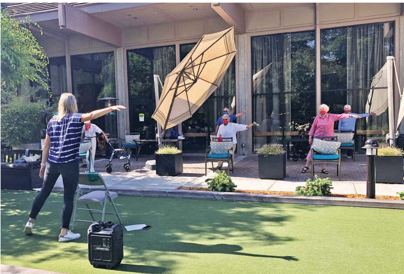
Spring Lake Village residents enjoy an outdoor socially-distanced exercise class.

Other communities have taken advantage of the virtual space to invite residents from