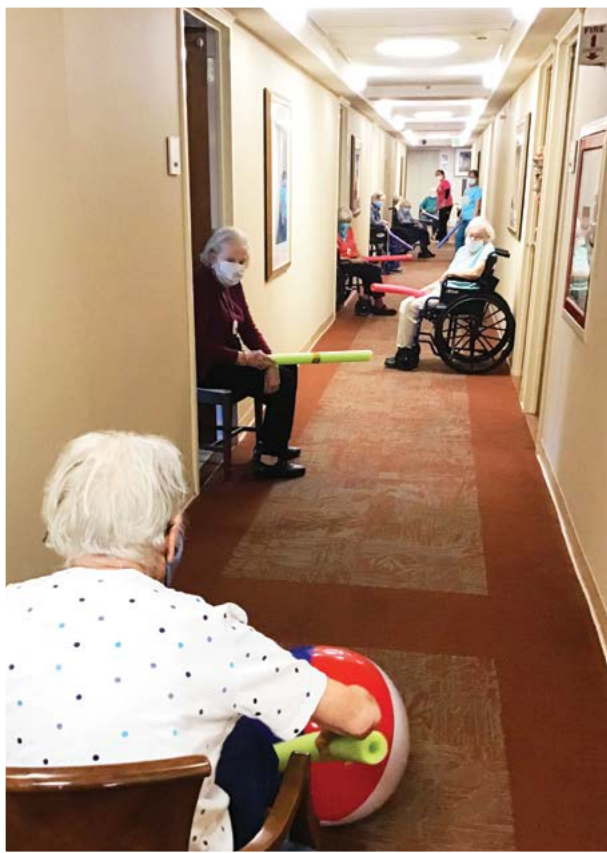
Assisted Living residents at St. Paul's Towers enjoy hallway hockey, a new pandemic activity.